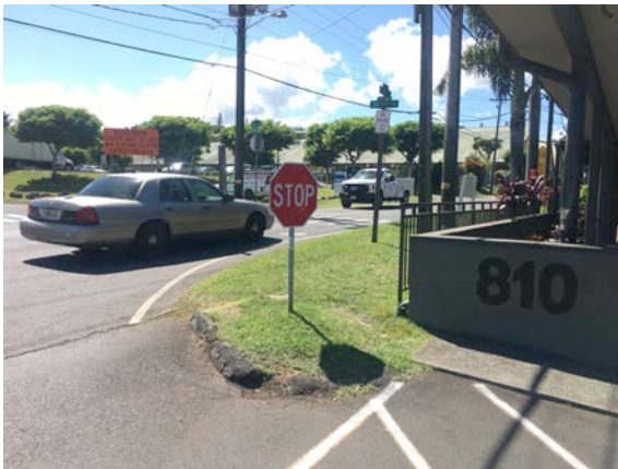
West Corner: Aloha Aina Center