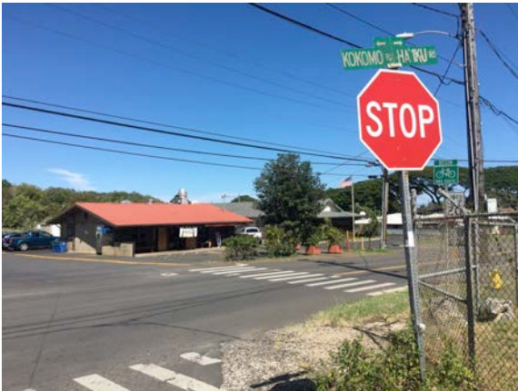
East Corner; Haiku & Kokomo