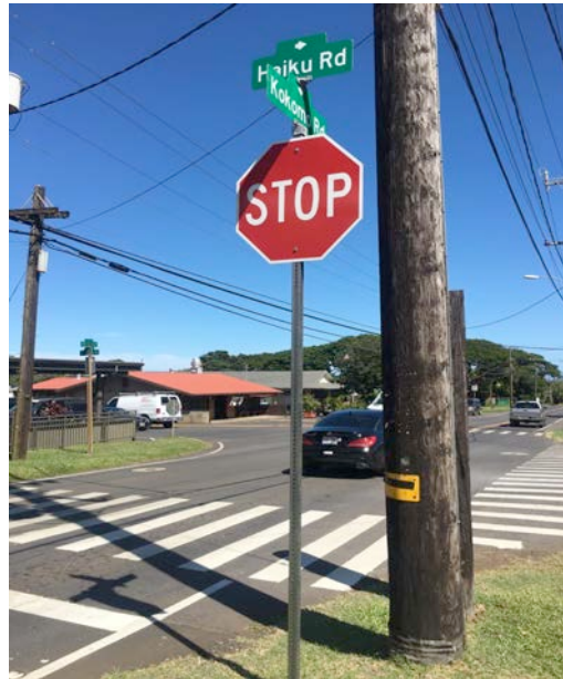
South Corner; Kokomo Road