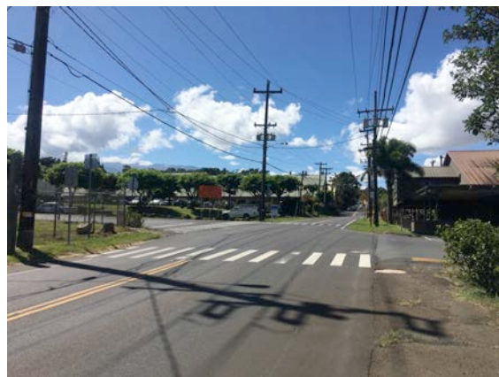
Crosswalk at the North Corner; Nuka Restaurant

Local residents traveling mauka up Haiku Road are accustomed to driving into this intersection without stopping. This poses a threat both to pedestrians and also to other drivers who are unfamiliar with this neighborhood. The area in front of Nuka, on the shoulder of Haiku Road, is now being used as a parking space, right up to the crosswalk. The owner of the Aloha Aina Center and the owner of Nuka support the addition of "no parking anytime" signs in the shoulder area in front of the Nuka parking lot on Haiku Road and directly across the street by the substation fence.